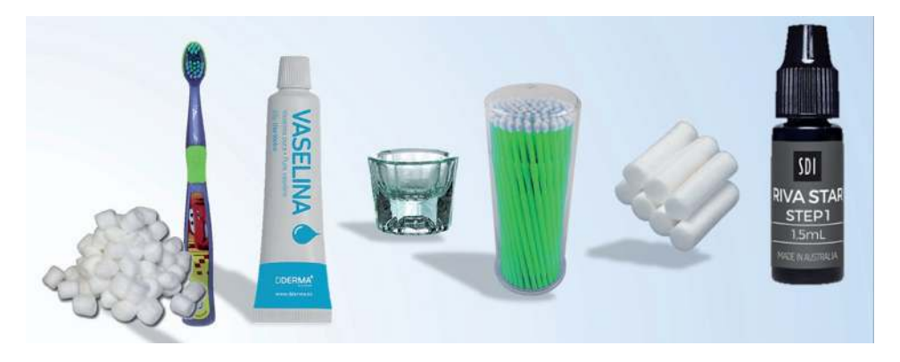
Figure 2. Material used for a SDF treatment.