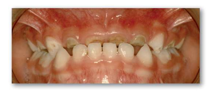
Figure 3. Patient with early childhood caries, exhibiting active caries lesions in enamel and dentin.