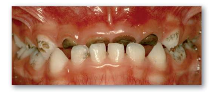
Figure 6. Clinical aspect in a follow-up consultation: darkening is evident without the progress of the carious lesions.

The application times can be shortened without any prejudice for the cariostatic effect when treating very young or very difficult to manage patients. Notwithstanding, the professional must monitor carefully at post-op consultation the lesion appearance; if it does not exhibit a darker and harder surface, re-application is needed.