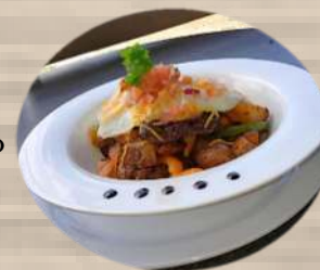
Churrasco a Caballo

Churrasco 6oz ( Skirt Steak ), Papas Salteadas ( Sauté Potatoes ) Huevo Frito ( Fried Egg ) & Pico de Gallo $14.99