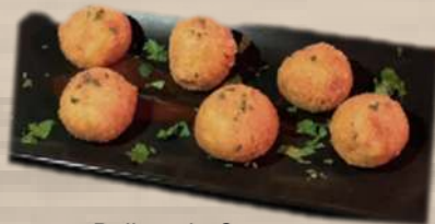
Bolitas de Queso

Nachos ó Papas Supreme de Pollo ó Carne Nachos or Fries Supreme with Chicken or Ground Beef $ 8.00