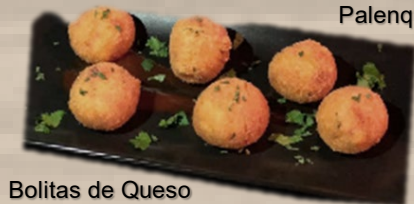
Bolitas de Queso