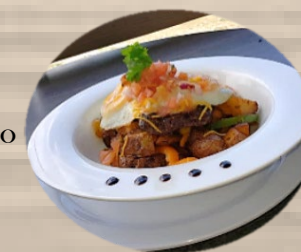
Churrasco a Caballo

Churrasco a Caballo Churrasco 6oz ( Skirt Steak ), Papas Salteadas ( Sauté Potatoes ) Huevo Frito ( Fried Egg ) & Pico de Gallo $19.99