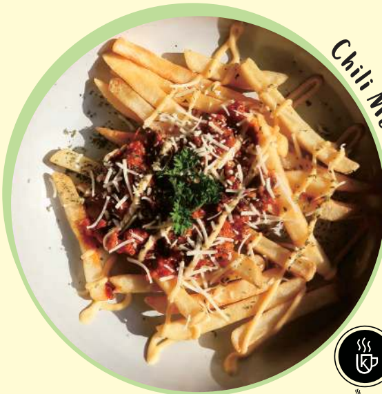
Chili Mentai Fries