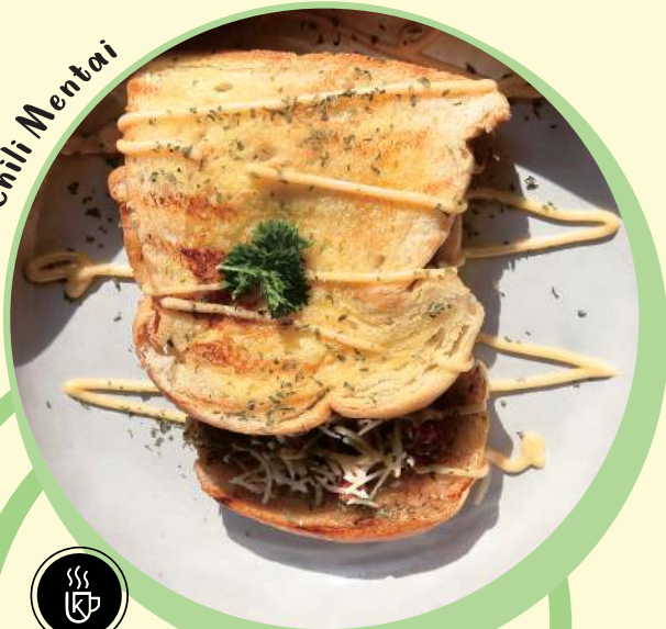
Ropan Chili Mentai