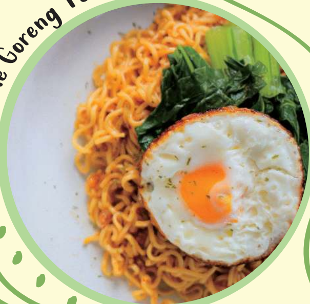
Mie Goreng Telur