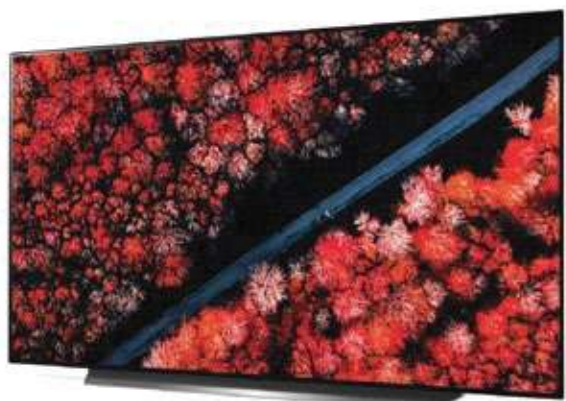
C9 65" / 55"