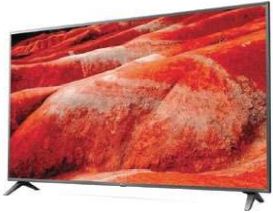
UM75 86" / 75" / 65" / 55" / 50" 43"