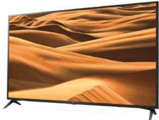
UM73 70" / 65" / 55" / 49" / 43"