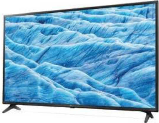
UM71 49" / 43"