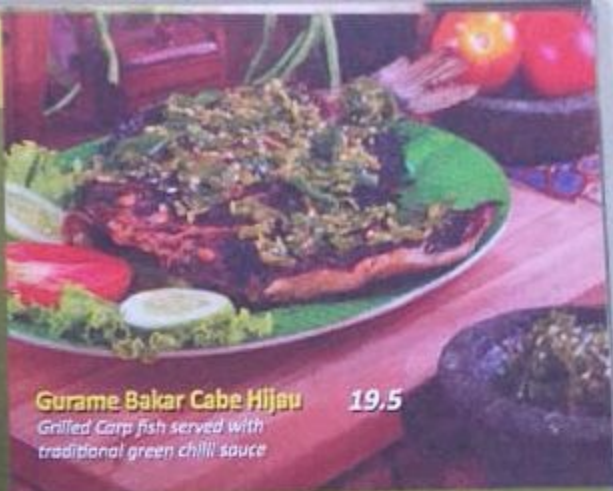
Gurame Bakar Cabe Hijau 19.5 Grilled Carp fish served with traditional green chilli sauce