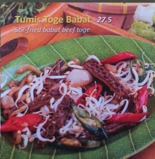
Tumis Toge Babat 27.5